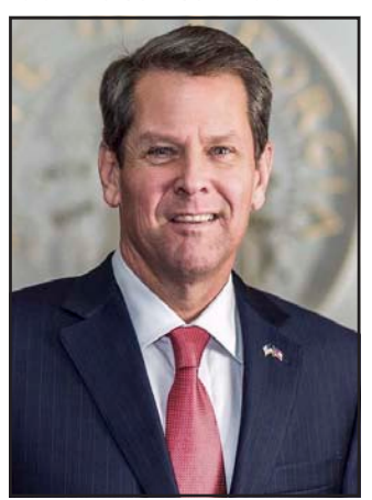
Gov. Brian Kemp perhaps even on a downward trend, despite new cases still being diagnosed and increased testing that now includes all symptomatic individuals, regardless of need for hospitalization.

Gov. Brian Kemp began allowing many businesses he'd closed earlier in the pandemic to voluntarily reopen starting April 24. Granted, these businesses must follow strict health guidelines to stay open, but now, a majority of states have begun to take Georgia's lead.